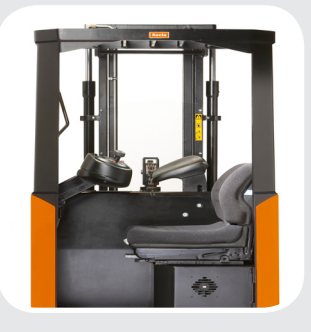
2. New comfortable seat and ergonomic driving position. The b2 control panel has a completely new digital display and control buttons in the middle.