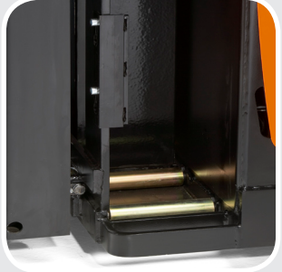
3. The design of the battery compartement allows easy access for maintenance purposes. The battery is mounted on rollers, which enables quick changing of the battery and supports multi-shift working.