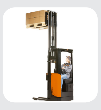
1.Lifting heights up to 6,5 m. Rocla designed integral mast in 2000 kg model enables automatic lift stop at wished lifting height.